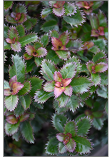
Sallywag Holly foliage