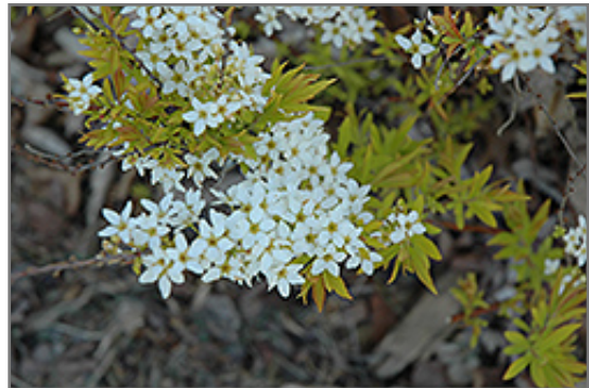
Mellow Yellow Spirea flowers

Thank you for choosing Seoane's Garden Center