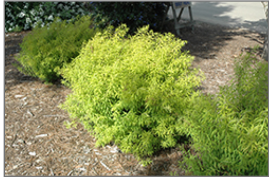
Mellow Yellow Spirea

Mellow Yellow Spirea is recommended for the following landscape applications;