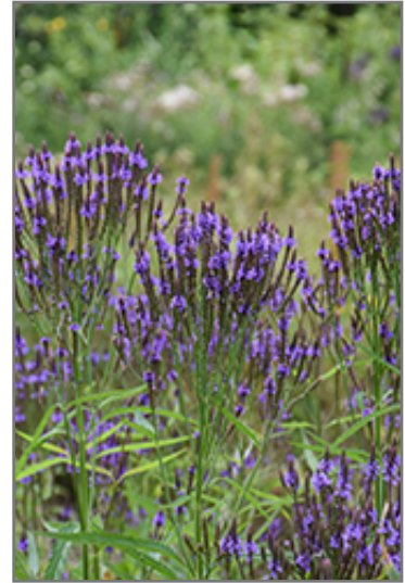
Blue Verbena flowers

Blue Verbena is recommended for the following landscape applications;