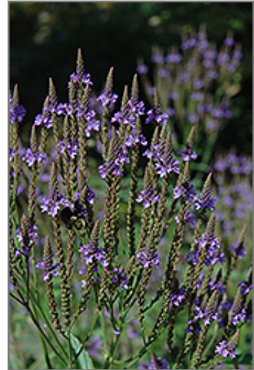
Blue Verbena flowers

* This is a 'special order' plant - contact store for details