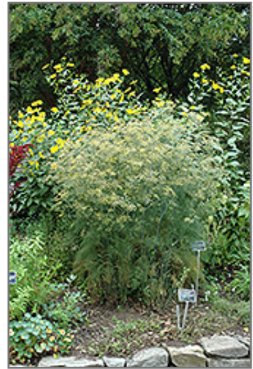
Fennel in bloom

Thank you for choosing Seoane's Garden Center