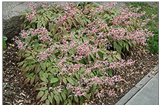
Pink Champagne Fairy Wings in bloom

Thank you for choosing Seoane's Garden Center