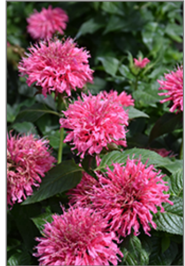
Bubblegum Blast Beebalm flowers