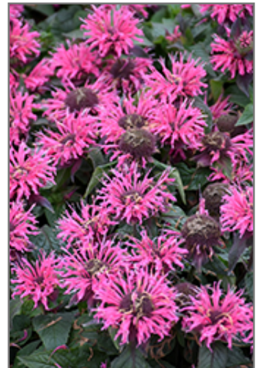
Bubblegum Blast Beebalm flowers

Thank you for choosing Seoane's Garden Center