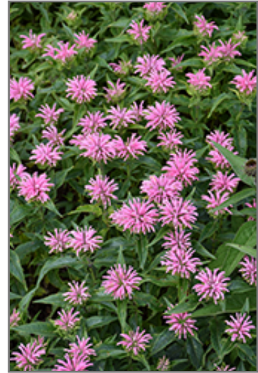
Pardon My Pink Beebalm flowers