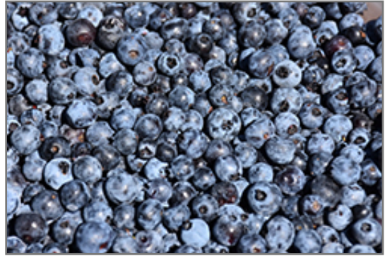
Lowbush Blueberry fruit

Lowbush Blueberry features dainty clusters of white bell-shaped flowers with shell pink overtones hanging below the branches in mid spring. It has dark green deciduous foliage. The oval leaves turn an outstanding scarlet in the fall. It features an abundance of magnificent blue berries in mid summer.