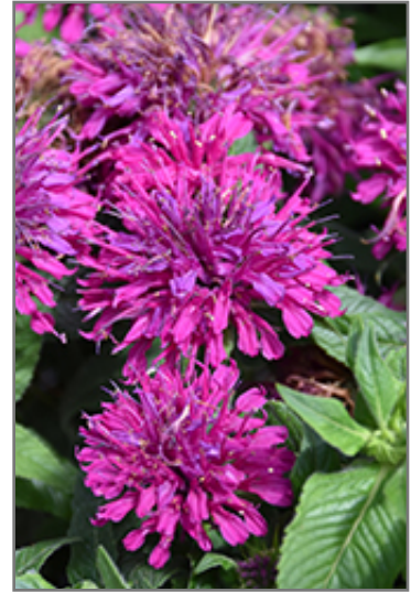
Grape Gumball Beebalm flowers

This variety forms a dense mound of purplish-pink flowers on well branched, strong stems, over lush dark green foliage that has an excellent resistance to powdery mildew; great for massing along borders