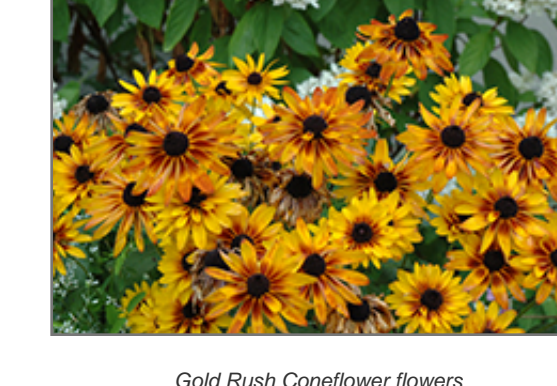
Gold Rush Coneflower flowers