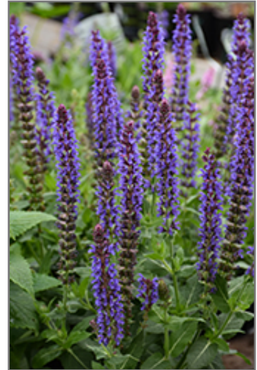
Violet Riot Sage flowers

Violet Riot Sage is recommended for the following landscape applications;