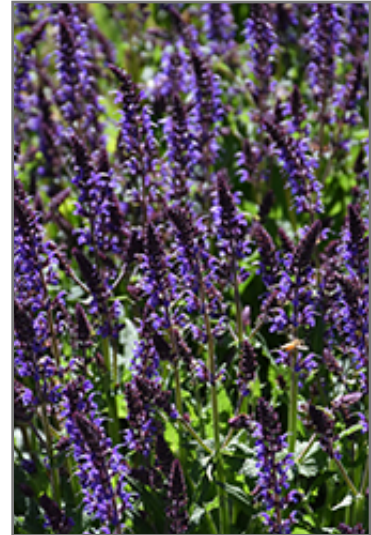
Violet Riot Sage flowers

Violet Riot Sage is a fine choice for the garden, but it is also a good selection for planting in outdoor pots and containers. With its upright habit of growth, it is best suited for use as a 'thriller' in the 'spiller-thriller-filler' container combination; plant it near the center of the pot, surrounded by smaller plants and those that spill over the edges. Note that when growing plants in outdoor containers and baskets, they may require more frequent waterings than they would in the yard or garden.