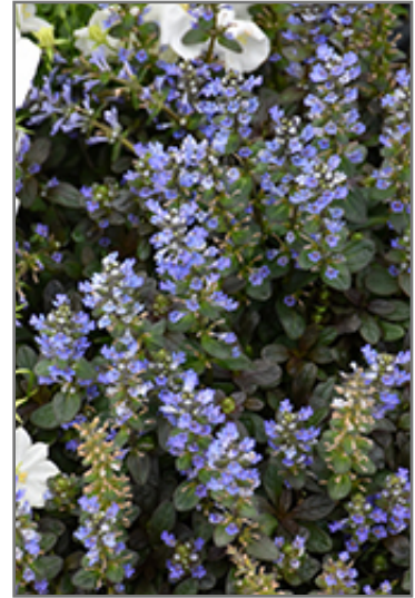
Chocolate Chip Bugleweed flowers

Chocolate Chip Bugleweed is recommended for the following landscape applications;