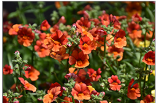
Sunsatia Blood Orange Nemesia flowers

Thank you for choosing Seoane's Garden Center