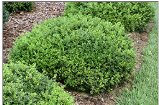
Tide Hill Boxwood

Thank you for choosing Seoane's Garden Center