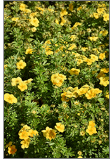
Happy Face Yellow Potentilla flowers

This shrub does best in full sun to partial shade. It is very adaptable to both dry and moist locations, and should do just fine under typical garden conditions. It is considered to be drought-tolerant, and thus makes an ideal choice for a low-water garden or xeriscape application. It is not particular as to soil type or pH. It is highly tolerant of urban pollution and will even thrive in inner city environments. This is a selection of a native North American species.