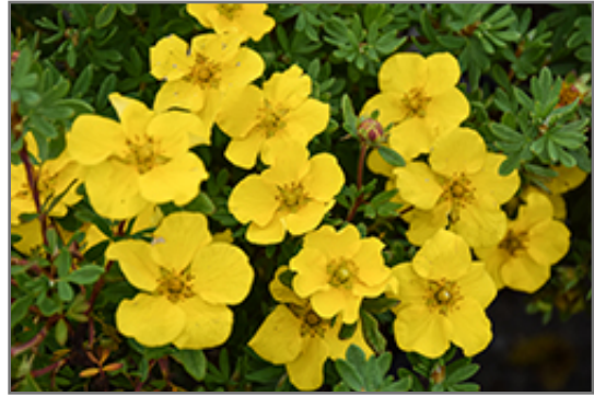
Happy Face Yellow Potentilla flowers

Happy Face Yellow Potentilla is recommended for the following landscape applications;