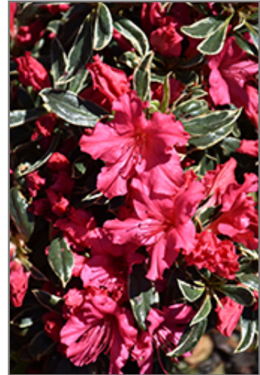
Silver Sword Azalea flowers