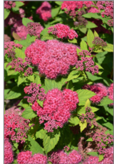
Double Play Red Spirea flowers

Double Play Red Spirea is recommended for the following landscape applications;