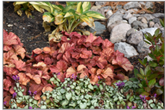
Northern Exposure Amber Coral Bells

Northern Exposure Amber Coral Bells will grow to be about 14 inches tall at maturity, with a spread of 20 inches. When grown in masses or used as a bedding plant, individual plants should be spaced approximately 16 inches apart. Its foliage tends to remain dense right to the ground, not requiring facer plants in front. It grows at a medium rate, and under ideal conditions can be expected to live for approximately 10 years. As an evergreen perennial, this plant will typically keep its form and foliage year-round.