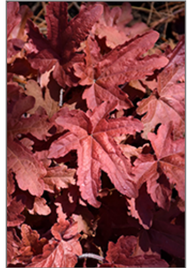
Fun and Games Red Rover Foamy Bells foliage

This is a relatively low maintenance plant, and should be cut back in late fall in preparation for winter. It is a good choice for attracting hummingbirds to your yard. It has no significant negative characteristics.