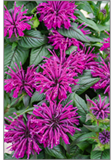
Rockin' Raspberry Beebalm flowers