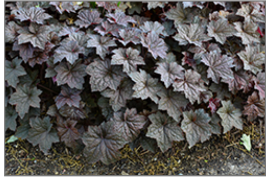
Palace Purple Coral Bells

Palace Purple Coral Bells will grow to be about 12 inches tall at maturity extending to 24 inches tall with the flowers, with a spread of 12 inches. When grown in masses or used as a bedding plant, individual plants should be spaced approximately 10 inches apart. Its foliage tends to remain dense right to the ground, not requiring facer plants in front. It grows at a medium rate, and under ideal conditions can be expected to live for approximately 10 years. As an evergreen perennial, this plant will typically keep its form and foliage year-round.