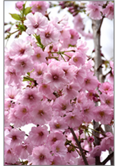
First Blush Flowering Cherry flowers