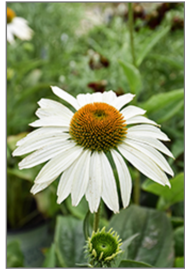
Happy Star Coneflower flowers

Thank you for choosing Seoane's Garden Center