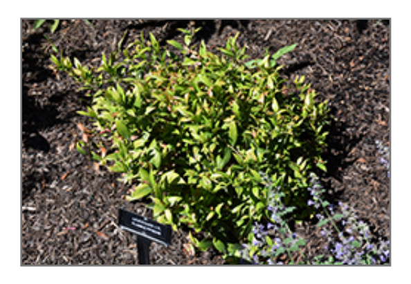
Leafscape Little Flames Fetterbush

Leafscape Little Flames Fetterbush is recommended for the following landscape applications;