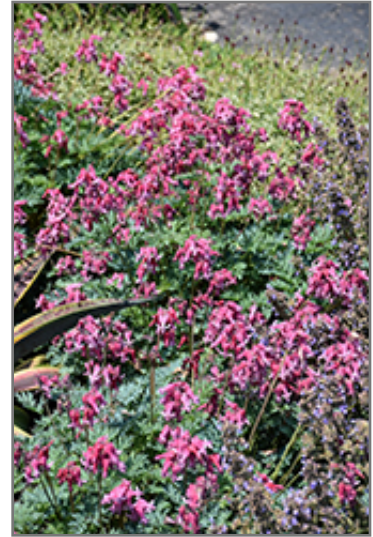
Pink Diamonds Fern-leaved Bleeding Heart flowers

Pink Diamonds Fern-leaved Bleeding Heart is an herbaceous perennial with a mounded form. It brings an extremely fine and delicate texture to the garden composition and should be used to full effect.