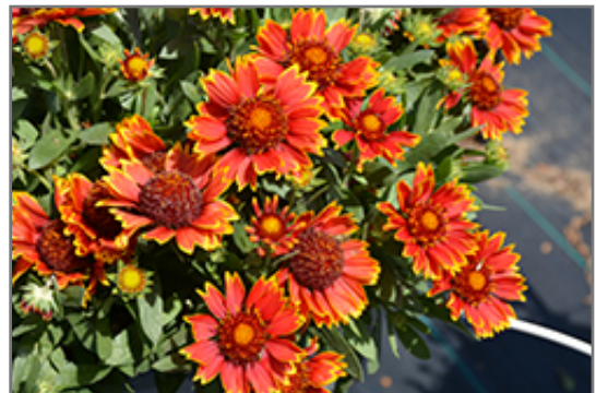
SpinTop Orange Halo Blanket Flower flowers

Thank you for choosing Seoane's Garden Center