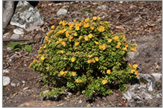
Marmalade Potentilla in bloom

This shrub does best in full sun to partial shade. It is very adaptable to both dry and moist locations, and should do just fine under typical garden conditions. It is considered to be drought-tolerant, and thus makes an ideal choice for a low-water garden or xeriscape application. It is not particular as to soil type or pH. It is highly tolerant of urban pollution and will even thrive in inner city environments. This is a selection of a native North American species.