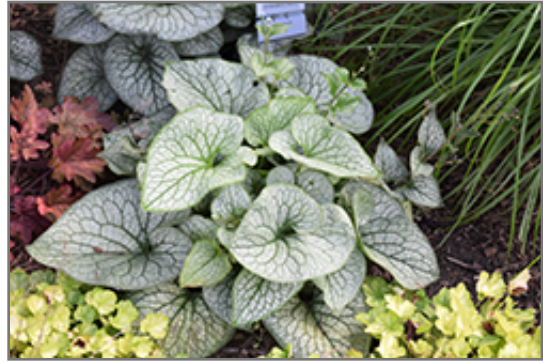
Queen of Hearts Bugloss foliage

Queen of Hearts Bugloss will grow to be about 18 inches tall at maturity extending to 30 inches tall with the flowers, with a spread of 3 feet. When grown in masses or used as a bedding plant, individual plants should be spaced approximately 30 inches apart. It grows at a medium rate, and under ideal conditions can be expected to live for approximately 10 years. As an herbaceous perennial, this plant will usually die back to the crown each winter, and will regrow from the base each spring. Be careful not to disturb the crown in late winter when it may not be readily seen!