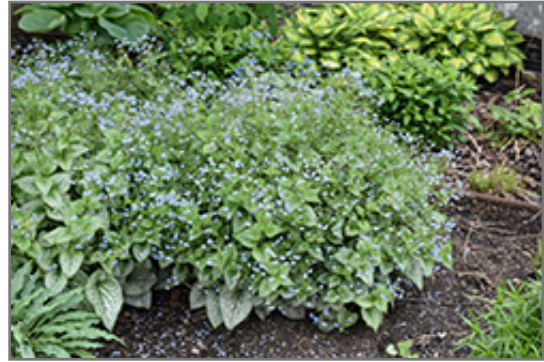
Queen of Hearts Bugloss in bloom

Queen of Hearts Bugloss is recommended for the following landscape applications;