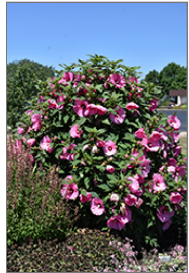
Summerific Candy Crush Hibiscus in bloom

Thank you for choosing Seoane's Garden Center