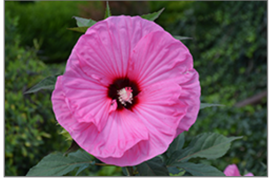
Summerific Candy Crush Hibiscus flowers

This plant will require occasional maintenance and upkeep, and should be cut back in late fall in preparation for winter. It is a good choice for attracting butterflies and hummingbirds to your yard. Gardeners should be aware of the following characteristic(s) that may warrant special consideration;