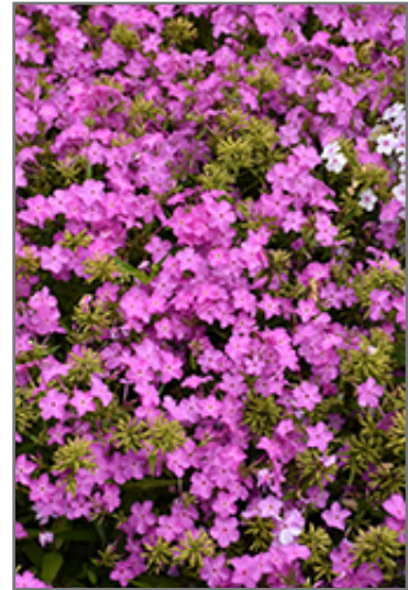
Opening Act Ultrapink Phlox flowers

Thank you for choosing Seoane's Garden Center