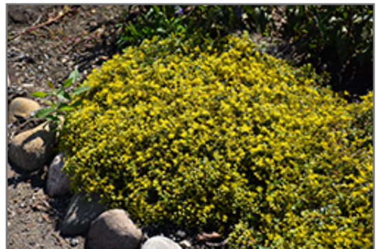
Rock 'N Low Yellow Brick Road Stonecrop in bloom

Thank you for choosing Seoane's Garden Center