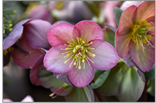
FrostKiss Cheryl's Shine Hellebore flowers

This is a relatively low maintenance plant, and should be cut back in late fall in preparation for winter. Deer don't particularly care for this plant and will usually leave it alone in favor of tastier treats. It has no significant negative characteristics.