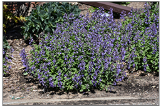
Picture Purrfect Catmint in bloom

Thank you for choosing Seoane's Garden Center