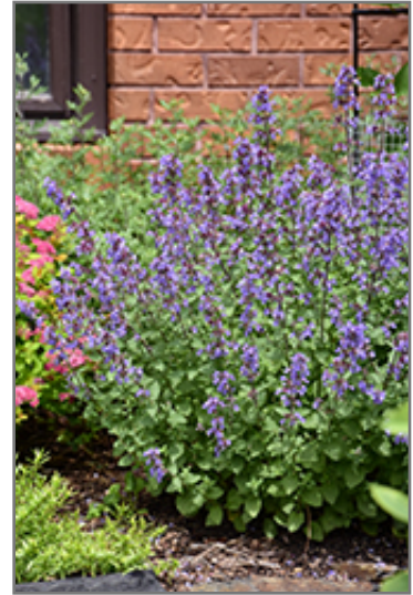
Picture Purrfect Catmint flowers

Picture Purrfect Catmint is a dense herbaceous perennial with a mounded form. Its relatively fine texture sets it apart from other garden plants with less refined foliage.