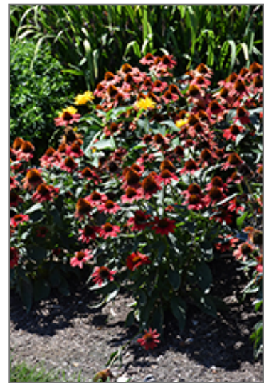
Color Coded Frankly Scarlet Coneflower in bloom

Thank you for choosing Seoane's Garden Center