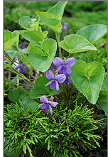
Woolly Blue Violet flowers

Woolly Blue Violet is recommended for the following landscape applications;