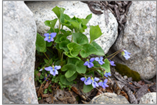
Woolly Blue Violet in bloom

Woolly Blue Violet will grow to be only 4 inches tall at maturity extending to 6 inches tall with the flowers, with a spread of 6 inches. When grown in masses or used as a bedding plant, individual plants should be spaced approximately 5 inches apart. Its foliage tends to remain low and dense right to the ground. It grows at a fast rate, and under ideal conditions can be expected to live for approximately 3 years. As an herbaceous perennial, this plant will usually die back to the crown each winter, and will regrow from the base each spring. Be careful not to disturb the crown in late winter when it may not be readily seen!