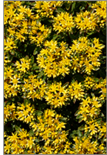
Rock 'N Round Bright Idea Stonecrop flowers

This is a relatively low maintenance plant, and is best cleaned up in early spring before it resumes active growth for the season. It is a good choice for attracting bees and butterflies to your yard, but is not particularly attractive to deer who tend to leave it alone in favor of tastier treats. It has no significant negative characteristics.