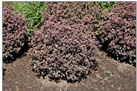
Rock 'N Grow Tiramisu Stonecrop in bloom