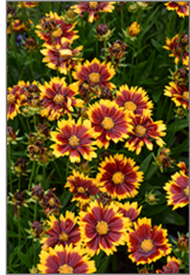
UpTick Red Tickseed flowers

UpTick Red Tickseed is recommended for the following landscape applications;