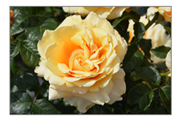
St. Tropez Rose flowers

551 Bedford St Abington, MA 02351 | 781-878-1306 | garden@seoanelandscape.com