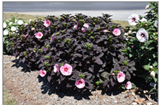
Summerific Edge of Night Hibiscus in bloom