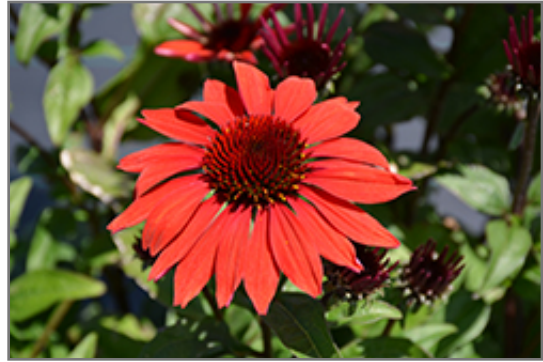
Panama Red Coneflower flowers

This is a relatively low maintenance plant, and is best cleaned up in early spring before it resumes active growth for the season. It is a good choice for attracting birds and butterflies to your yard, but is not particularly attractive to deer who tend to leave it alone in favor of tastier treats. It has no significant negative characteristics.