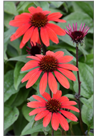
Panama Red Coneflower flowers

Panama Red Coneflower will grow to be about 10 inches tall at maturity extending to 14 inches tall with the flowers, with a spread of 10 inches. Its foliage tends to remain low and dense right to the ground. It grows at a medium rate, and under ideal conditions can be expected to live for approximately 10 years. As an herbaceous perennial, this plant will usually die back to the crown each winter, and will regrow from the base each spring. Be careful not to disturb the crown in late winter when it may not be readily seen!