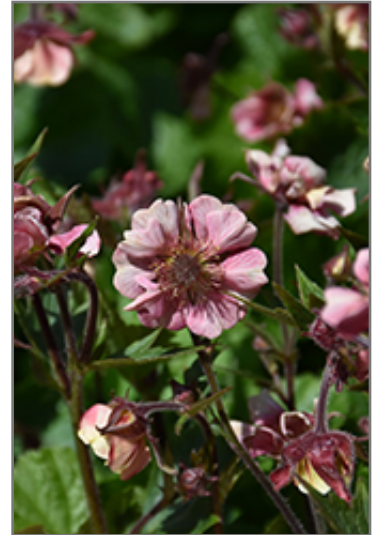
Tempo Rose Avens flowers

Tempo Rose Avens is recommended for the following landscape applications;