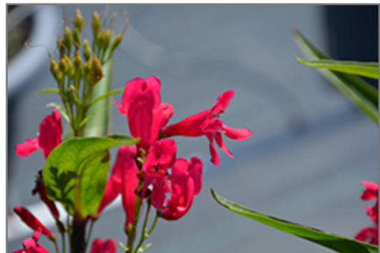
Pristine Deep Rose Beardtongue flowers

Thank you for choosing Seoane's Garden Center