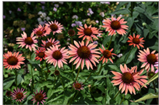
Big Sky Sundown Coneflower flowers

Thank you for choosing Seoane's Garden Center