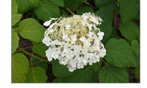
Haas' Halo Hydrangea flowers