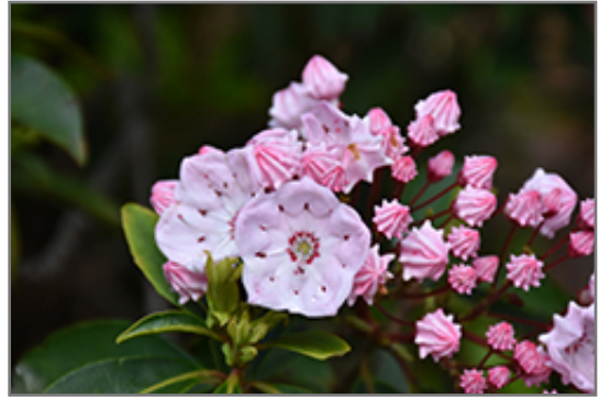
Tinkerbell Mountain Laurel flowers

A very compact spring blooming broadleaf evergreen shrub with lovely deep pink buds producing very pale pink flowers in spring; must have exacting growing conditions; superbly drained highly acidic and organic soil with a heavy mulch