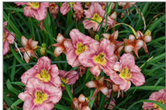
Happy Ever Appster Rosy Returns Daylily flowers

Thank you for choosing Seoane's Garden Center