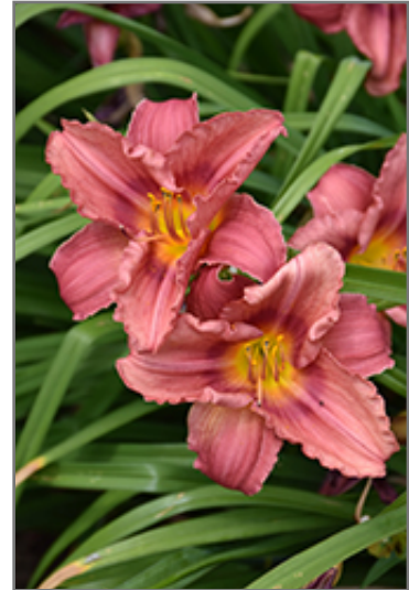
Happy Ever Appster Rosy Returns Daylily flowers

This is a relatively low maintenance plant, and is best cleaned up in early spring before it resumes active growth for the season. It is a good choice for attracting butterflies to your yard. It has no significant negative characteristics.