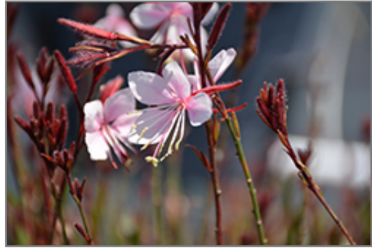
Steffi Blush Pink Gaura flowers

This is a relatively low maintenance plant, and is best cleaned up in early spring before it resumes active growth for the season. It is a good choice for attracting bees and butterflies to your yard, but is not particularly attractive to deer who tend to leave it alone in favor of tastier treats. It has no significant negative characteristics.