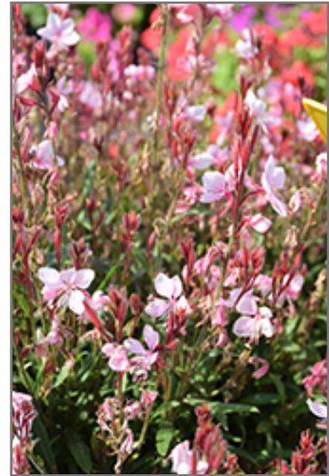
Steffi Blush Pink Gaura flowers

Thank you for choosing Seoane's Garden Center