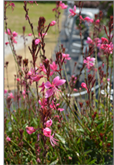
Steffi Dark Rose Gaura flowers

Steffi Dark Rose Gaura is recommended for the following landscape applications;