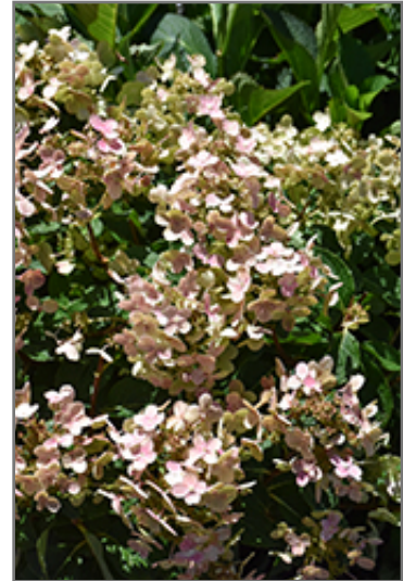
Early Evolution Hydrangea flowers

Early Evolution Hydrangea is recommended for the following landscape applications;